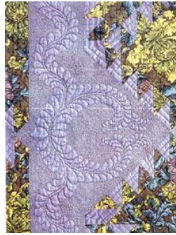
Machine Quilting "Lilac Feathers" (detail)