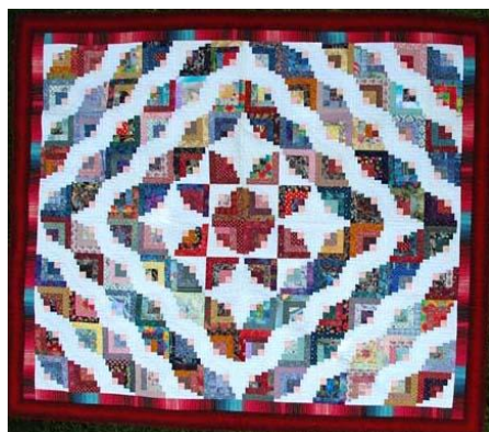
Curved Log Cabin