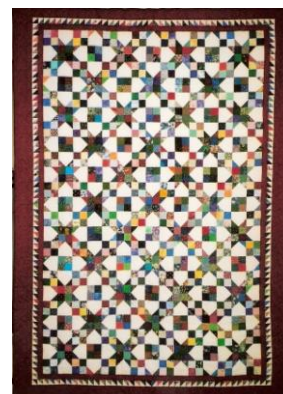
Snappy Scrappy Stars

Sponsors Coats & Clark, Handi Quilter and AMB International/At Home Quilting generously support the World Quilt Show – New England and the 2010 World Quilt Competition XIV.